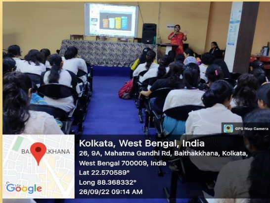
Kolkata, West Bengal, India 26, 9A, Mahatma Gandhi Rd, Baithakkhana, Kolkata, West Bengal 700009, India Lat 22.570589° Long 88.368332° 26/09/22 09:14 AM