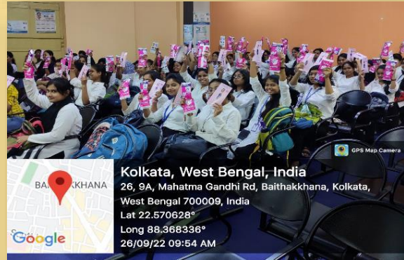
Kolkata, West Bengal, India 26, 9A, Mahatma Gandhi Rd, Baithakkhana, Kolkata, West Bengal 700009, India Lat 22.570628° Long 88.368336° 26/09/22 09:54 AM