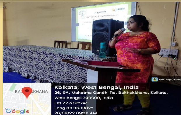
Kolkata, West Bengal, India 26, 9A, Mahatma Gandhi Rd, Baithakkhana, Kolkata, West Bengal 700009, India Lat 22.570674° Long 88.368382° 26/09/22 09:10 AM