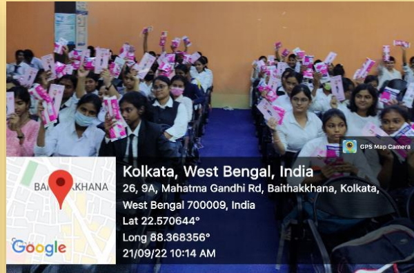
Kolkata, West Bengal, India 26, 9A, Mahatma Gandhi Rd, Baithakkhana, Kolkata, West Bengal 700009, India Lat 22.570644° Long 88.368356° 21/09/22 10:14 AM