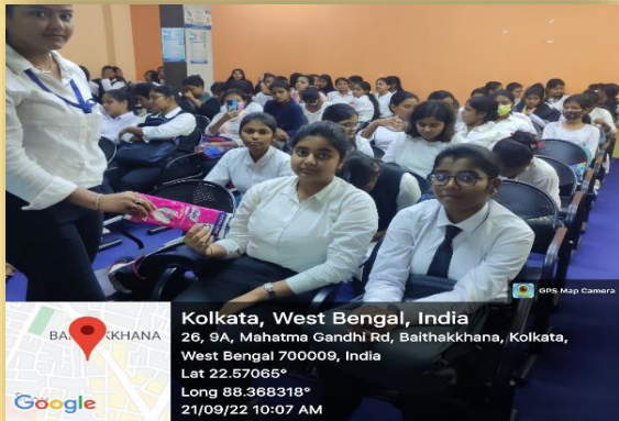
Kolkata, West Bengal, India 26, 9A, Mahatma Gandhi Rd, Baithakkhana, Kolkata, West Bengal 700009, India Lat 22.570685° Long 88.368318° 21/09/22 10:07 AM